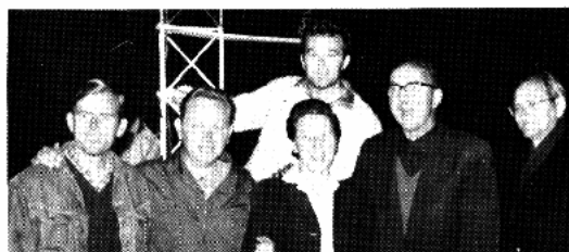
The CE6CA multi-multi operation was quite a project.