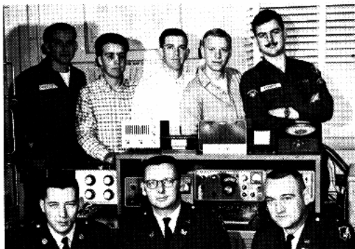
The crew at club station KA9MF, top multi-operator, single transmitter station for Asia. L to R: Front row—W8FCW, WA1DSN, W0NMH. Back row—FA3IBN, K9PVD, W3CJX, WB2HMF and S. Bassett (no call, must have been included for decorative purposes. How about that set of handle-bars). The other asset at the station was a TH6-DX on a 170 ft tower.