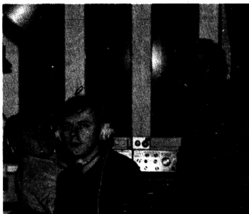
Operating high above Beirut, new Multi-Single champion OD5IQ scored just under 4 million. Congratulations to team OH2BH, OH2MM, OD5HC.