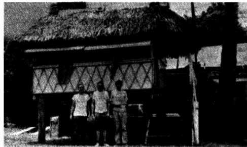
The FWØAA Multi-Single crew—exactly the way you'd picture a DX-pedition to a South Pacific island. That's WB6LTJ, K6RIR, K6YFZ.